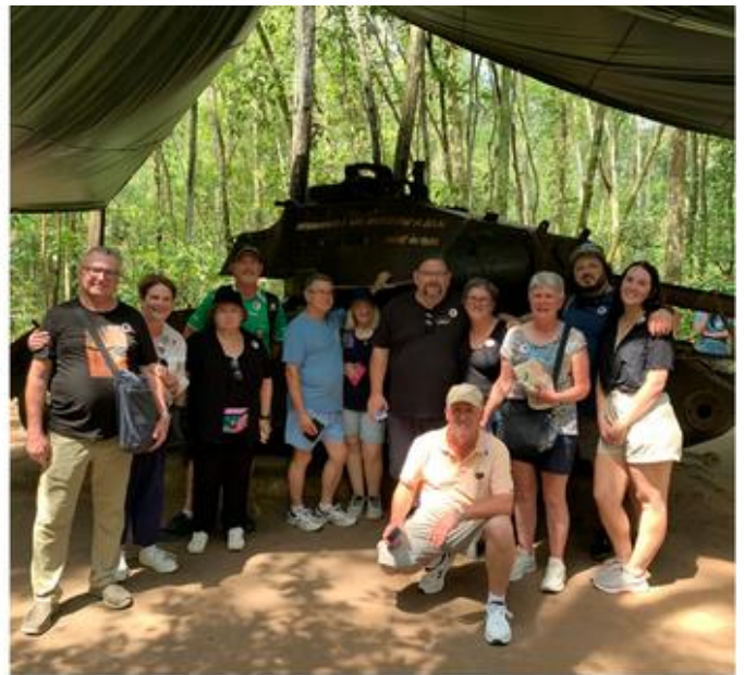
Cu Chi Tunnels