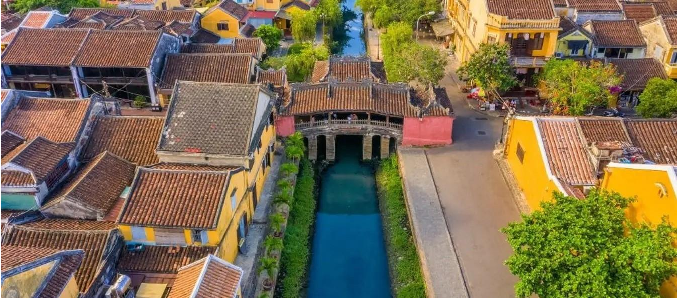
Japanese Covered Bridge