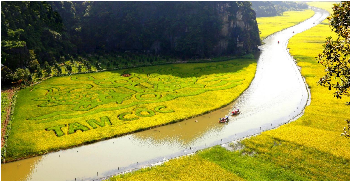
Tam Coc in ripe rice season

Morning, picks you up at your hotel, then leave by coach to Hoa Lu (2.5 hrs). Visit the historic capital of Vietnam and the famous ancient temples of Le and the Dinh Dynasties.