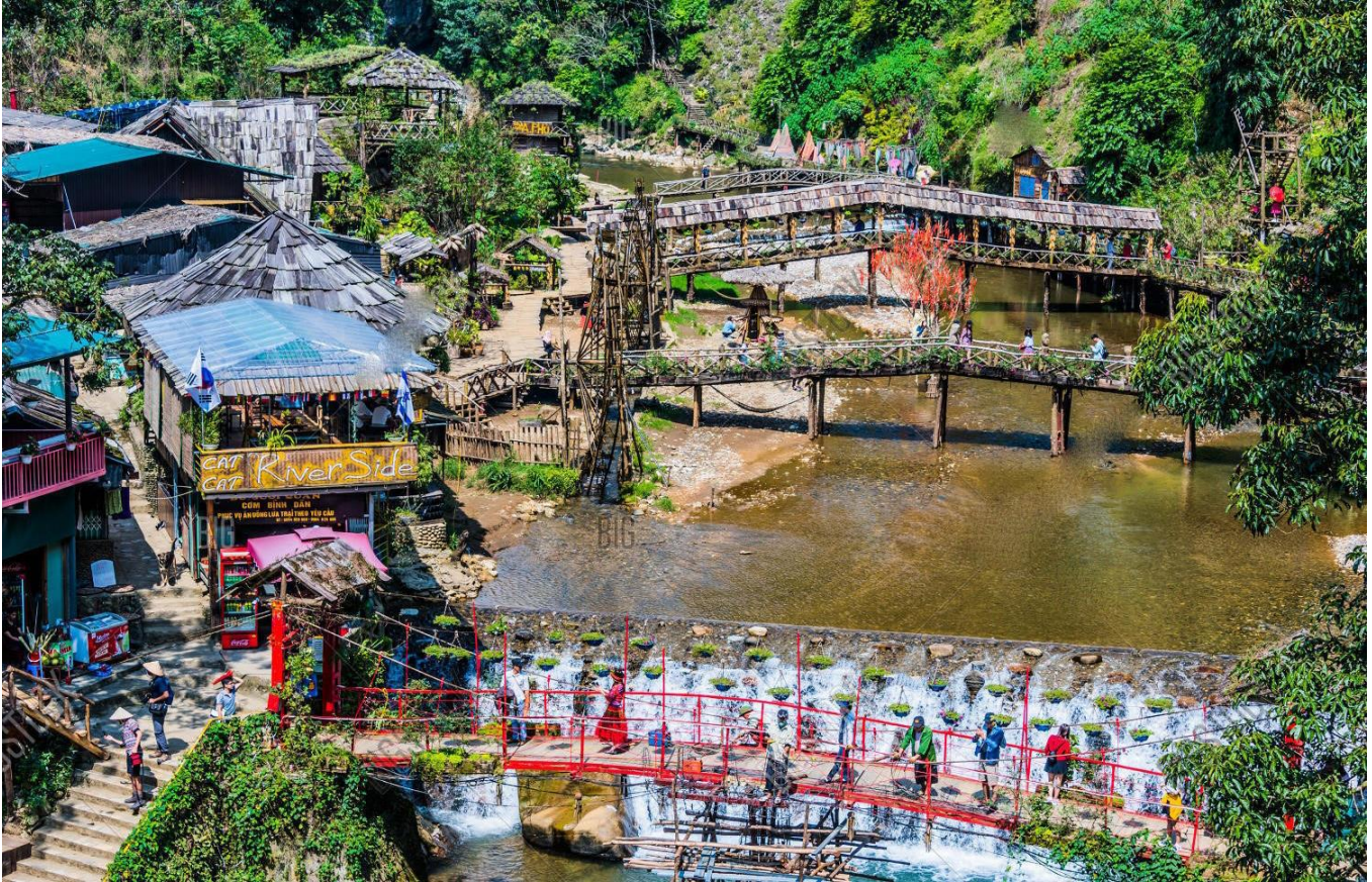
Cat Cat village

vendors along the street sell local textiles and handicraft. Visit Cat Cat village where you will visit the village of Black H'mong hill tribes. Enjoy the beautiful landscapes of Sapa Valley.