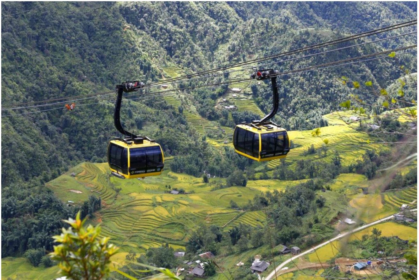
Fansipan Cable Car

Afternoon: you will transfer to Fansipan Cable Car Station that takes you about 15 minutes instead of 3-day climbing two to four days as before. After arriving at the station, visitors will take about 20 – 30 minutes to climb 600 more ladders to reach the top of Fansipan peak, and touch the landmark in the roof of Indochina.