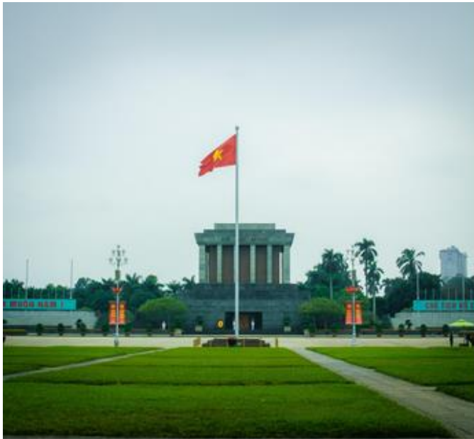
Ho Chi Minh Mausoleum

Full day city tour to visit landmarks and other the major interesting sites like Ho Chi Minh Mausoleum (closed on every Monday, Friday morning and every afternoon), One Pillar Pagoda , The Temple of Literature , visit the Vietnam National History of Museum .