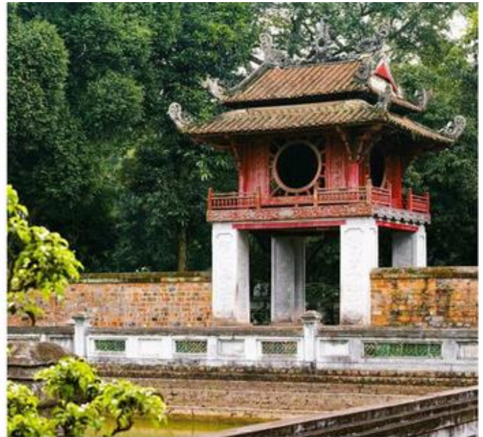
Temple of Literature

Then we will take 1 hour by cyclo ride through Hanoi's Old Quarters to experience daily life of people who are living in the oldest parts of the city, Enjoy the famous traditional Water Puppetry Show in Thang Long Theatre then we will go to Hanoi Railway station to catch night train to Sapa.